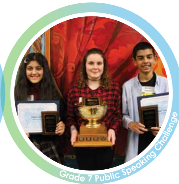
Grade 7 Public Speaking Challenge