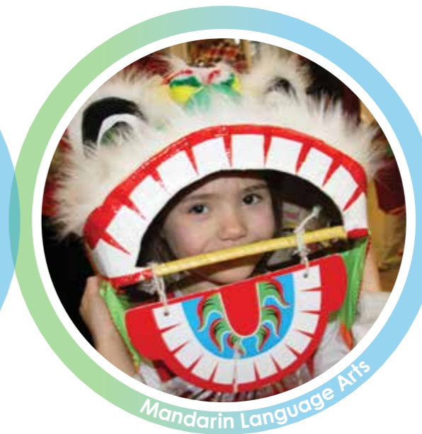
Mandarin Language Arts