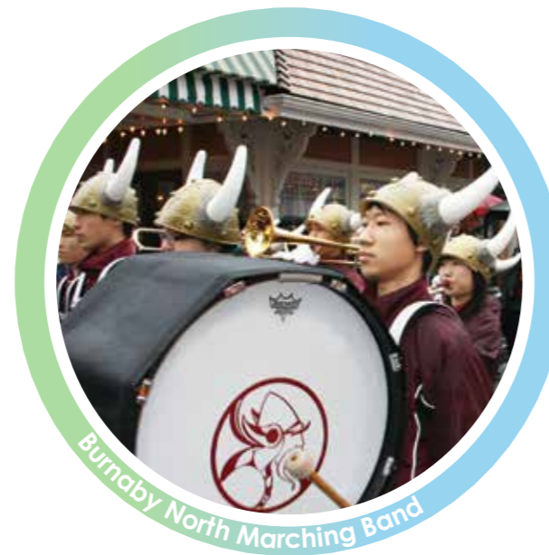
Burnaby North Marching Band