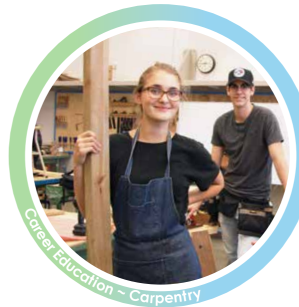
Career Education ~ Carpentry