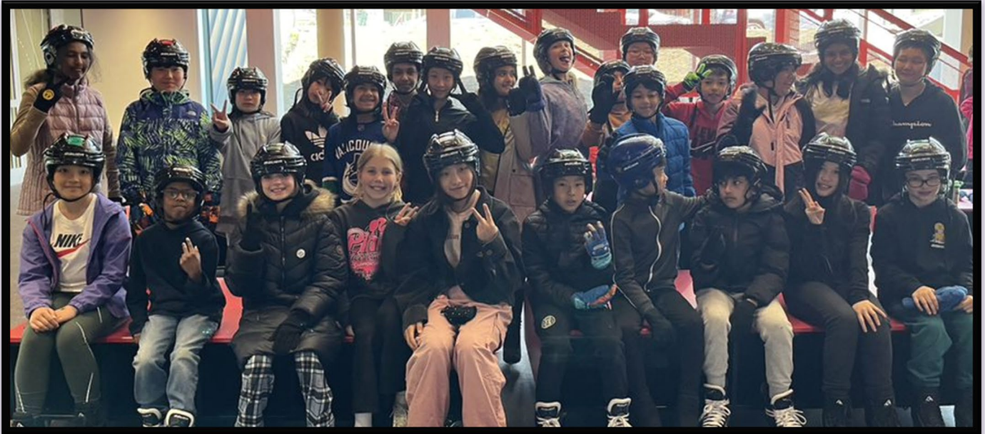
Division 4 Skating May 17, 2024

Please ensure that all Library Books are returned to the Library by Thursday, June 13 th