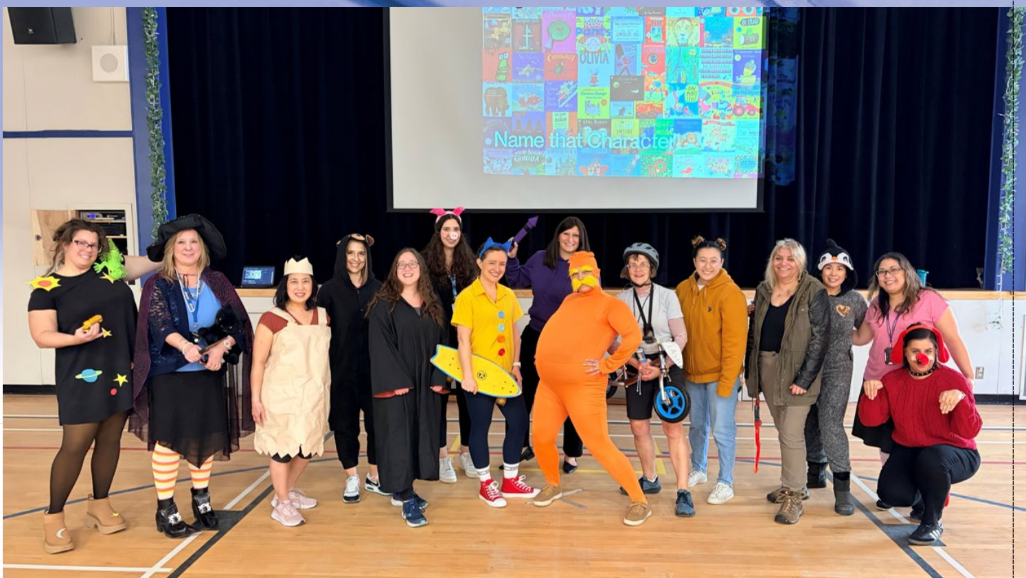
Kicking off Literacy Week in style; can you guess these characters?