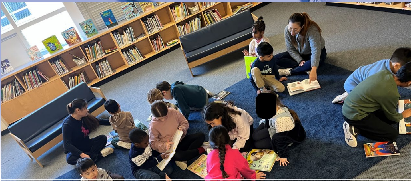
Division 11 and 6 partner reading.