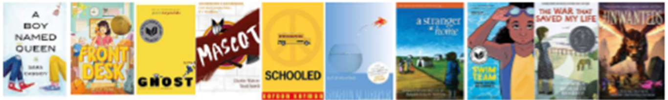
Battle of the Books 2026